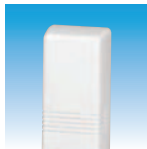
5816 Two-Zone Door/Window Transmitter