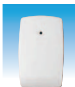
5853 Glassbreak Sensor